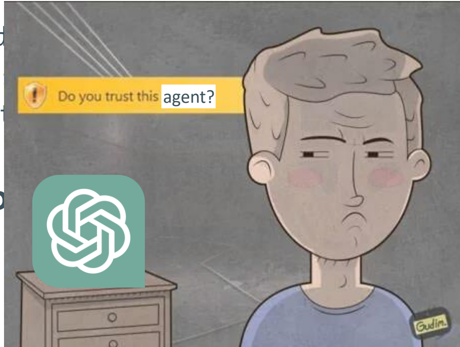
Image source: https://imgur.com/GI6POZG , ChatGPT Logo: https://chat.openai.com/favicon-32x32.png